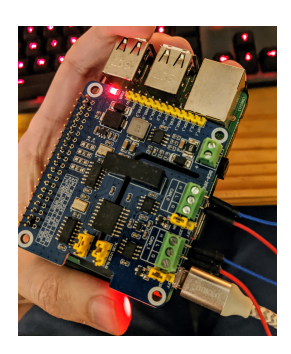
Figure 2: Raspberry Pi 3 testbed with Waveshare 2-CH CAN FD HAT. Both CAN channels are connected to each other to detect transmitted messages over the CAN interface.

This allows for quickly changing between ECUs without modifying any real hardware, applying DevOps techniques to embedded system development.