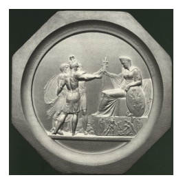
7."Popular Irregulars", French Invasion of Russia 1812